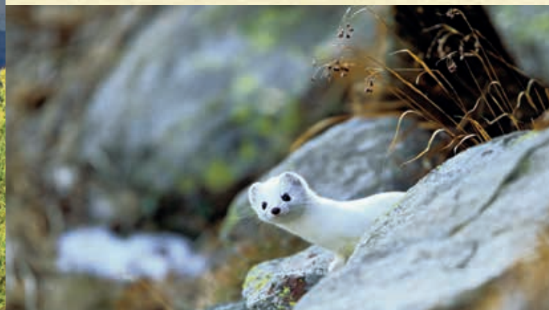
Ermine: Stoat in his winter coat

For further information: www.ersaf.lombardia.it