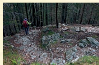
Mule track on Alpe Legnone - ABOVE Monte Legnone seen from Lago di Mezzola