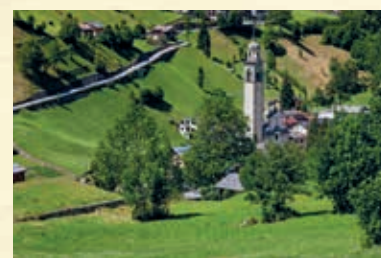
Hamlet of Gerola Alta - ABOVE DOSSO CAVALLO in Valle di Bomino