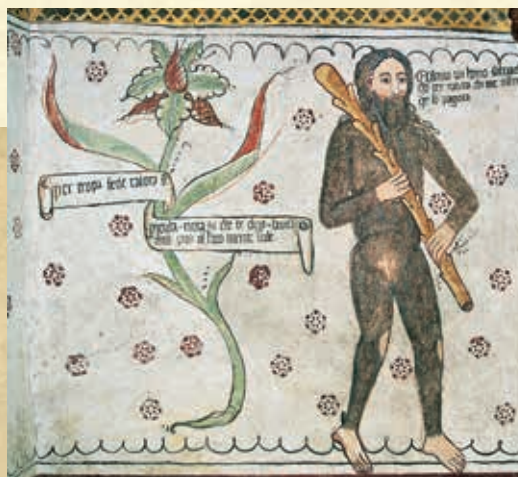
Homo salvadego in Sacco