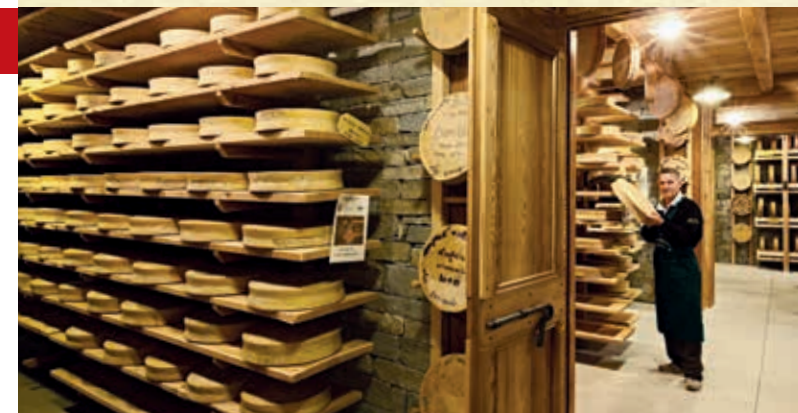
Center of the Bitto Storico in Gerola Alta

Entering the Casa del Tempo is like stepping back in time to rediscover the history of the Orobic Alps and Val Gerola in particular. Despite the sometimes confused and fragmented traces, this fascinating journey goes back many millions of years. The Casa del Tempo is where the marks of time have been collected, starting from geology, through animal and plant life all the way to humans and the history of their lives. This is the ideal starting point of the Val Gerola Eco-museum.