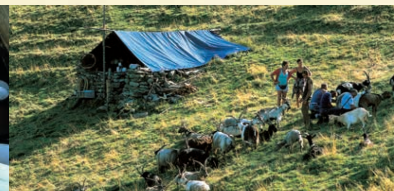
Lago di Culino